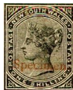
Specimen Type B21a (in red)