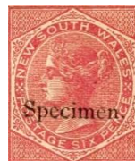
Specimen Type B21a