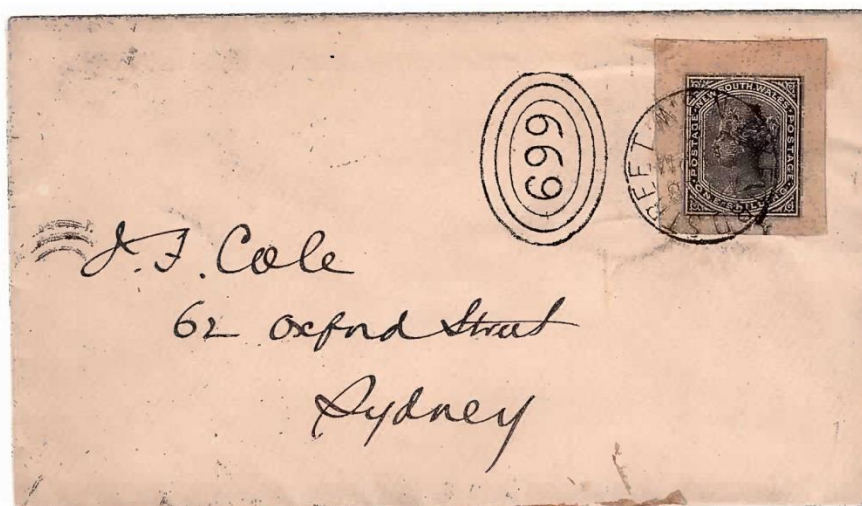
Example of 1/- Cut-out used for postage